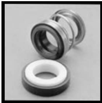
TYPE PN & PNL